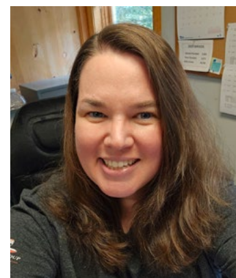
EXECUTIVE DIRECTOR'S NOTE

The need for our services continues to increase as we receive new Neighbor applications on a weekly basis. However, we continue to need more volunteers to meet the requests of our Neighbors. If you, or someone you know, may be interested in volunteering, please contact us. I am always happy to answer any questions you may have about our organization.