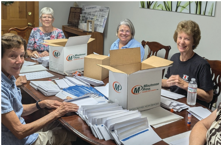
Summer Newsletter Stuffing

In the coming year, our goals include updating our strategic plan and having gatherings for our Neighbors. We need your help to be able to accomplish these goals and keep ICCI strong.