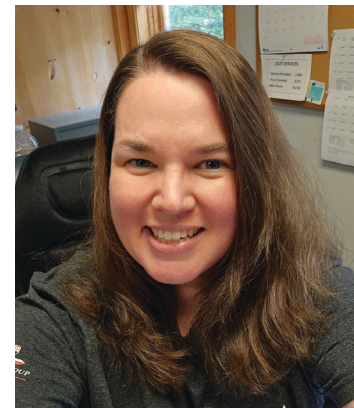
EXECUTIVE DIRECTOR'S NOTE