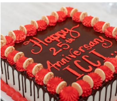
Cake by Bald Peak CC