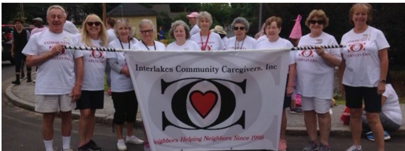
ICCI members marched in the Meredith Anniversary Parade