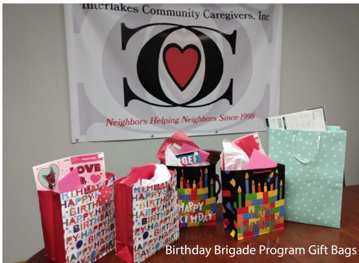
Birthday Brigade Program Gift Bags

News Flash!! -we are fortunate to once again be chosen as the beneficiary of the Temple B'nai Israel's "We Care"