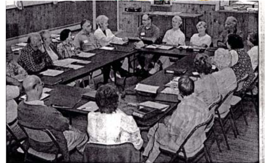
The Original Caregivers' Volunteers at Training Session

The program was managed by a committee and completely staffed by Volunteers. The first Volunteer education course was held for 25 Volunteers who were all Church members. Volunteers handled operational duties from their homes. A telephone line was located at Bayswater Books in Center Harbor calls were forwarded each day to the Coordinator on duty. About 500 services were provided.